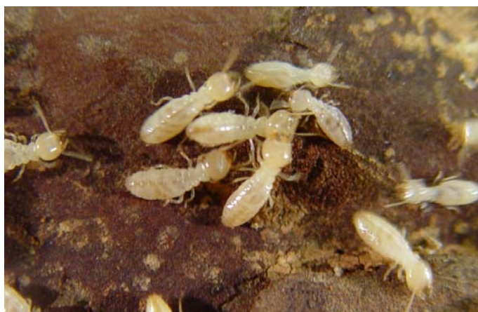
Fig 1: Termites interact with each other as they work within the subterranean environment.

Termites are social insects. Their highly evolved, behavioral system for communication, coordination and mutual defense operates through the interactions of individual termites (Fig. 1). When termites meet in a darkened gallery of their subterranean world, they instinctively “check each other out” by a series of antennae touching and mutual grooming (known as “allogrooming”). This serves a defensive role, by identifying intruders, but more importantly these encounters transmit subtle messages among colony members.