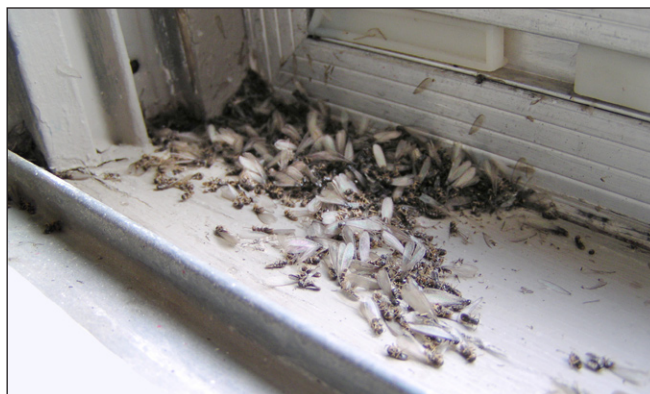
Dead termite swarmers in window sill.

of termite swarmers —small, black, winged insects that swarm in the spring. Even years after the swarm, wings may be found in cobwebs or in areas not cleaned very often. If evidence of swarmers is found inside, it is likely that worker termites are present, because swarmers emerge from mud tubes made by workers.