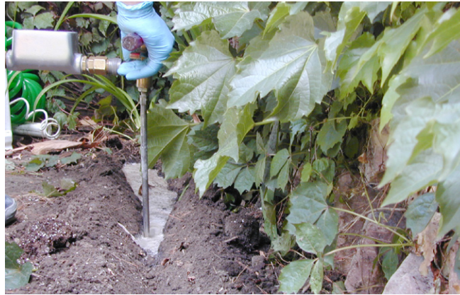
Application outdoors — filling trench